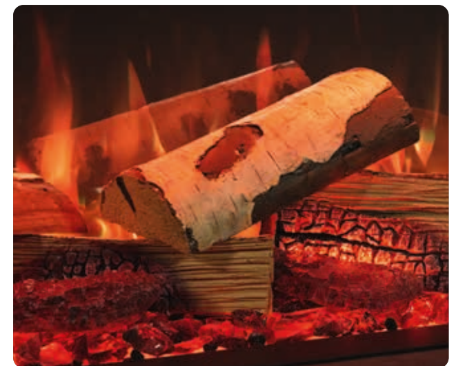
Optional Split Silver Birch Log-effect