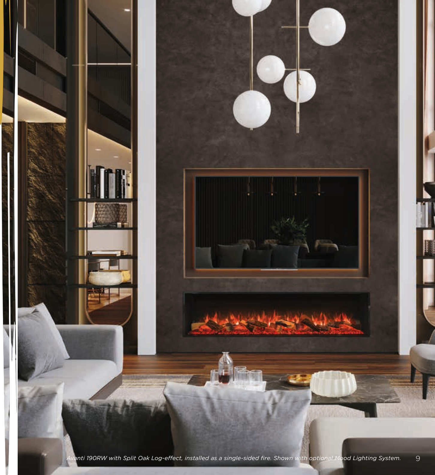
Avanti 190RW with Split Oak Log-effect, installed as a single-sided fire. Shown with optional Mood Lighting System.

See pages 3, 5 & back cover for additional images