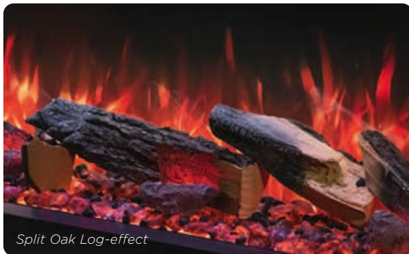
Split Oak Log-effect

See pages 3, 5 & back cover for additional images