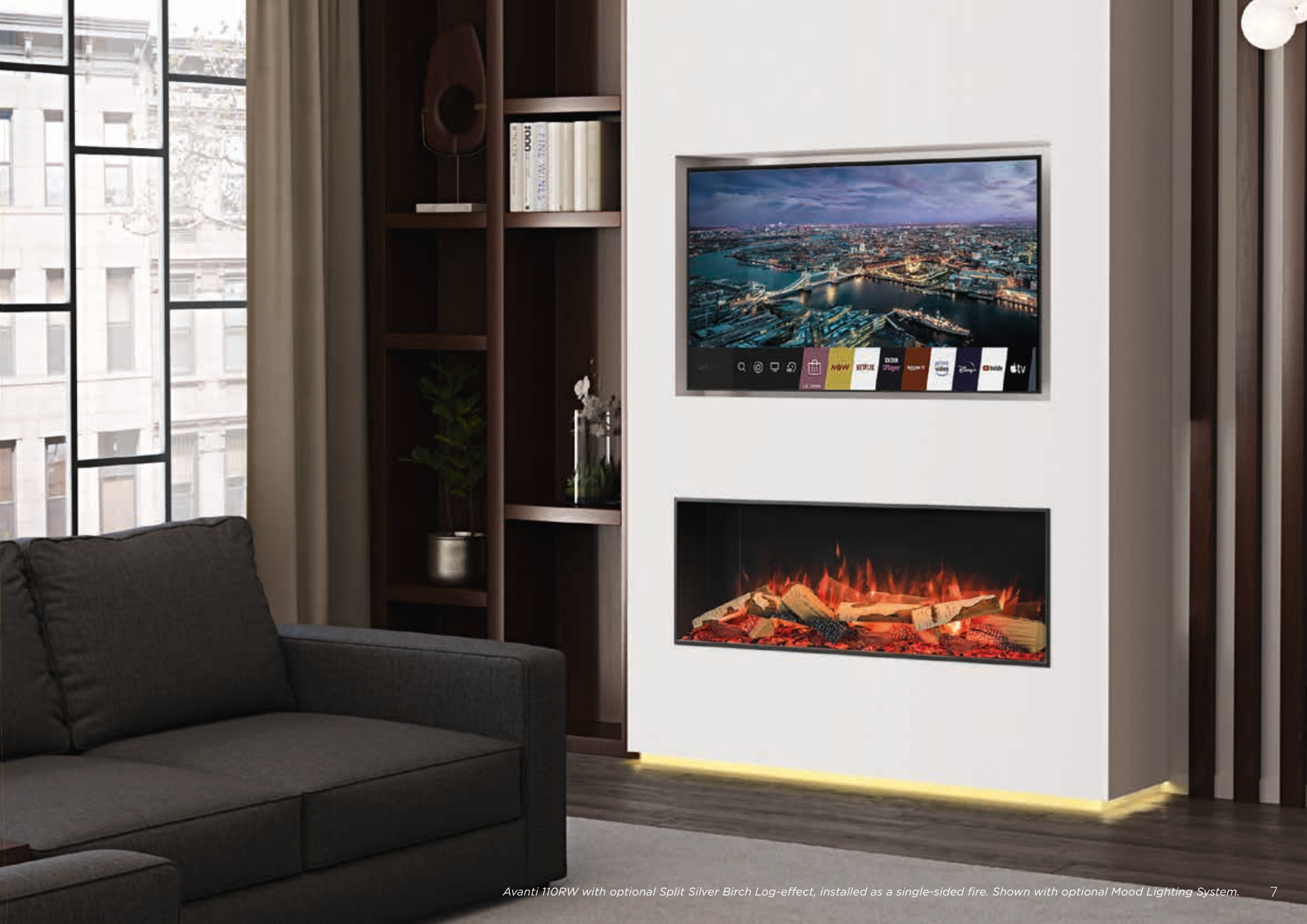
Avanti 110RW with optional Split Silver Birch Log-effect, installed as a single-sided fire. Shown with optional Mood Lighting System.