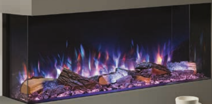
Avanti 110RW with Split Oak Log-effect, installed as a two-sided corner fire.