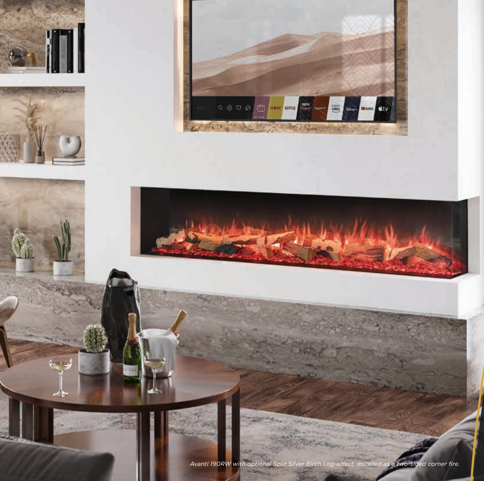
Avanti 190RW with optional Split Silver Birch Log-effect, installed as a two-sided corner fire.